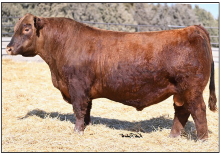
GRU Just N Time 714J