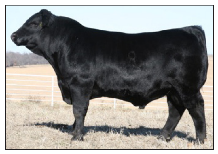
JRI Wow Factor 254C282