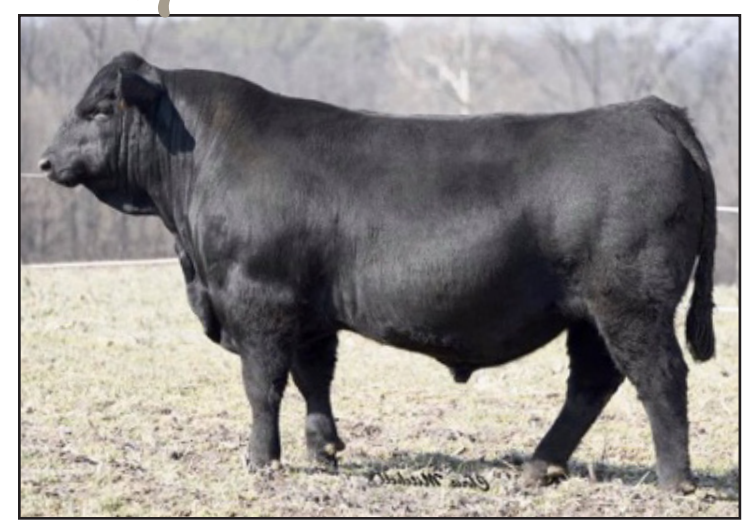
JKGF Civil War E92